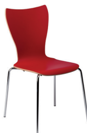
1743 A : 16" C : 17 1/2" E : 17 1/2"