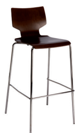
1781 A : 14 1/2" C : 29 1/2" E : 12"