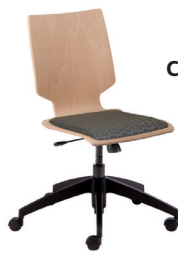
1761 A : 16" C : 15 - 20 1/2" E : 17 1/2"