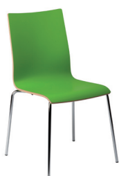
1742 A : 16" C : 17 1/2" E : 17 1/2"