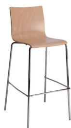
1782 A : 14 1/2" C : 29 1/2" E : 12"