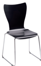
1753 A : 16" C : 17 1/2" E : 17 1/2"