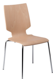
1741 A : 16" C : 17 1/2" E : 17 1/2"