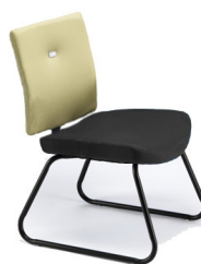
VTM2T A : 19 1/2" C : 18 1/2" E : 19"