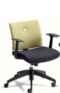
VTM1 A : 19 1/2" C : 17 3/4 - 22 3/4" E : 15"