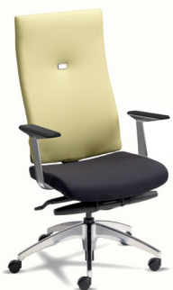
VTM4 A : 19 1/2" C : 17 3/4 - 22 3/4" E : 27"