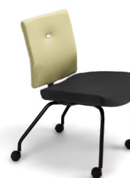
VTM2R A : 19 1/2" C : 18 1/2" E : 19"