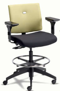
VTM1-DSN A : 19 1/2" C : 24 1/4 - 34 1/4" E : 19"