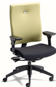
VTM3 A : 19 1/2" C : 17 3/4 - 22 3/4" E : 23"