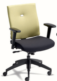
VTM2 A : 19 1/2" C : 17 3/4 - 22 3/4" E : 19"