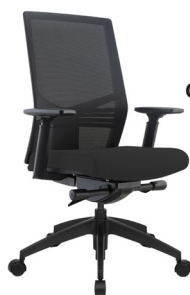
VTMM A : 19 1/2" C : 17 3/4 - 22 3/4" E : 24 1/2"