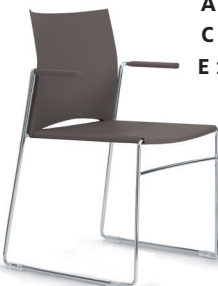
76-PG A : 17 1/2" C : 18 1/2" E : 15 1/2"