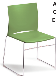
75-PV A : 17 1/2" C : 18 1/2" E : 15 1/2"