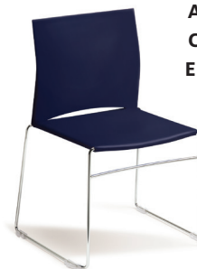
75-PB A : 17 1/2" C : 18 1/2" E : 15 1/2"