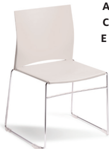
75-PW A : 17 1/2" C : 18 1/2" E : 15 1/2"