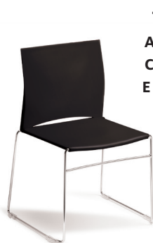
75-PN A : 17 1/2" C : 18 1/2" E : 15 1/2"