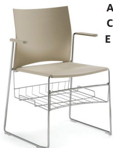
76-PS A : 17 1/2" C : 18 1/2" E : 15 1/2"