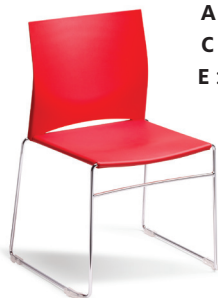
75-PR A : 17 1/2" C : 18 1/2" E : 15 1/2"