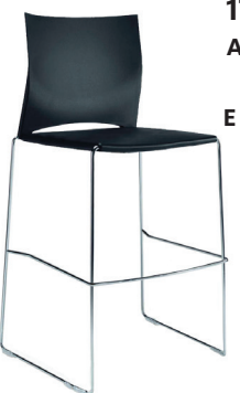
175-PN A : 17 1/2" C : 28" E : 15 1/2"