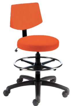
1507 DSN A : 17" C : 24 - 34" E : 10 1/2"