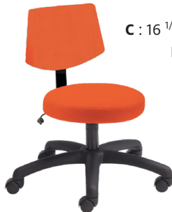
1507 A : 17" C : 16 1/4" - 21 1/4" E : 10 1/2"