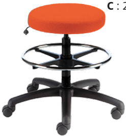
1500 DSN A : 17" C : 23 3/4" - 33 3/4"