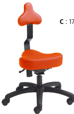
MED A : 15" C : 17 3/4" - 22" E : 8 1/2"