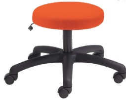
1500 A : 17" C : 16 - 21"