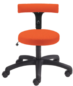
Q1500 A : 17" C : 16 - 21" E : 3 1/2"