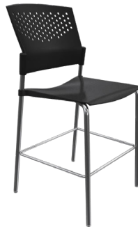
PN7 A : 17" C : 24" E : 13"