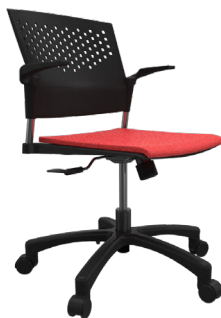
PNL A : 17" C : 17-22" E : 13"