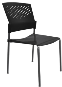
PN4 A : 17" C : 18" E : 13"