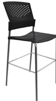
PN8 A : 17" C : 30" E : 13"