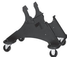
PN20 A : 22" C : 24"