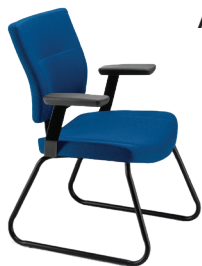
L9001 T A : 20 1/2" C : 18" E : 17"