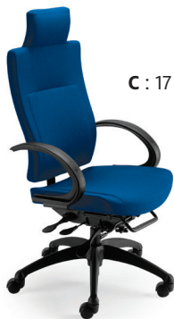
L9003 A : 20 1/2" C : 17 1/4- 22 1/4" E : 29"