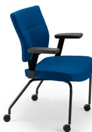
L9001 PR A : 20 1/2" C : 18" E : 17"