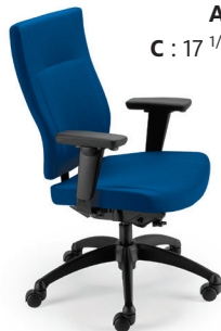
L9002 A : 20 1/2" C : 17 1/4- 22 1/4" E : 23"