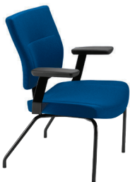
L9001 P A : 20 1/2" C : 18" E : 17"