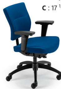
L9001 A : 20 1/2" C : 17 1/4- 22 1/4" E : 17"