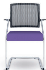
3104 A : 19" C : 19" E : 17"