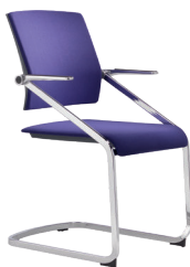
3102 A : 19" C : 19" E : 17"