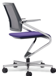
3007 A : 19" C : 19" E : 17"