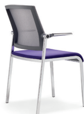
3103 A : 19" C : 19" E : 17"