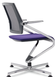
3006 A : 19" C : 19" E : 17"