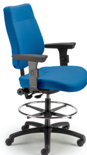
4002 DSN A : 20" C : 24 - 34" E : 19"