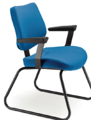
4001 T A : 20" C : 17 1/2" E : 15"