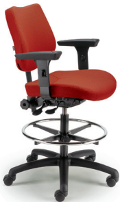
4001 DSN A : 20" C : 24 - 34" E : 15"