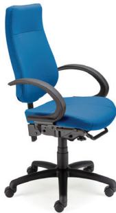
4003 A : 20" C : 17 - 22" E : 23"