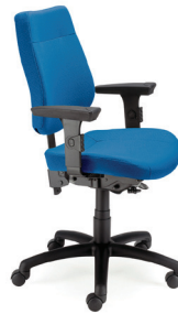
4002 A : 20" C : 17 - 22" E : 19"