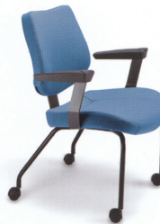
4001 PR A : 20" C : 18" E : 15"