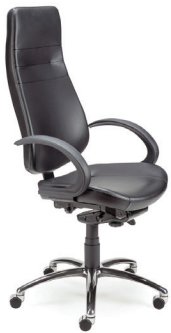
4004 A : 20" C : 17 - 22" E : 28"