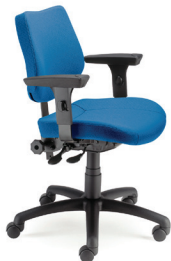
4001 A : 20" C : 17 - 22" E : 15"