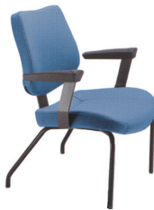
4001 P A : 20" C : 18" E : 15"