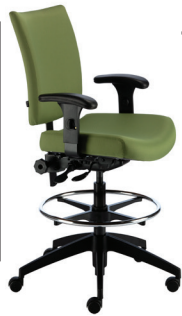
1070 DSN A : 19 1/2" C : 24 - 34" E : 19"