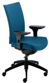
1090 A : 19 1/2" C : 17 - 22" E : 24"