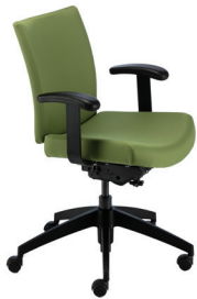
1070 A : 19 1/2" C : 17 - 22" E : 19"