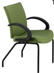
1070 P/PR A : 19 1/2" C : 17 1/2" E : 19"