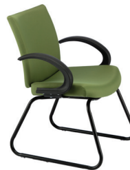
1070 T A : 19 1/2" C : 17 1/2" E : 19"