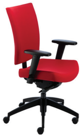
1080 A : 19 1/2" C : 17 - 22" E : 21 1/2"