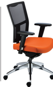
1082 A : 19 1/2" C : 17 - 22" E : 21 1/2"