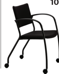
1012 P/PR A : 18" C : 17 1/2" E : 11 1/2"