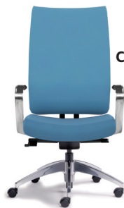
FIR4 A : 19 1/2" C : 16 3/4 - 20 1/2" E : 24 1/2"