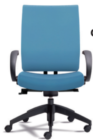
FIR3 A : 19 1/2" C : 16 3/4 - 20 1/2" E : 21 1/2"