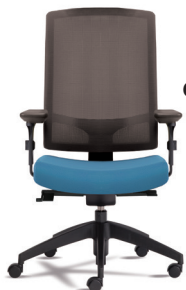
FIM3 A : 19 1/2" C : 16 3/4 - 20 1/2" E : 23 1/2"