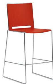
AGPS A : 18" C : 29" E : 15" F : 22 1/2"