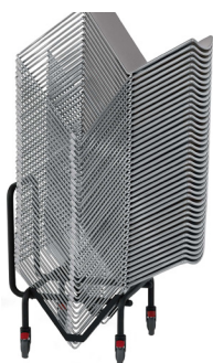
CA1 40 1/2" 27 1/4" 36"