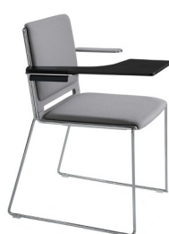
AGPT-D2 A : 18" C : 17 1/2" E : 15" F : 22 1/2"