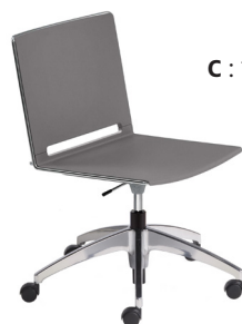
AGPB A : 18" C : 15 1/2" - 21" E : 15" F : 22 1/2"