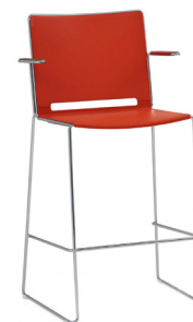
AGPS-D2 A : 18" C : 28" E : 15" F : 22 1/2"