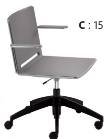
AGPB-D2 A : 18" C : 15 1/2" - 20 3/4" E : 15" F : 22 1/2"