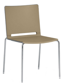
AGPP A : 18" C : 17 1/2" E : 15" F : 22 1/2"