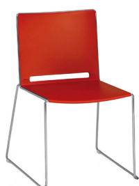
AGPT A : 18" C : 17 1/2" E : 15" F : 22 1/2"