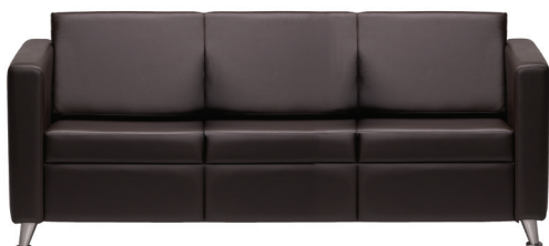
2003 A : 75" C : 18" E : 17"