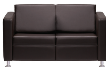
2002 A : 53" C : 18" E : 17"