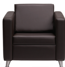
2001 A : 31" C : 18" E : 17"