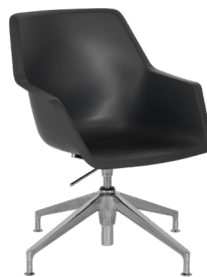
REP A : 18" C : 17-22" E : 17"