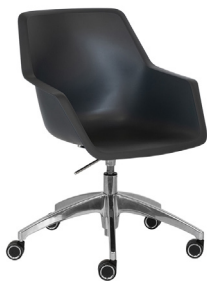
REE A : 18" C : 15-18 1/2 " E : 17"