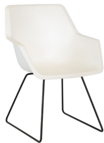
RET A : 18" C : 17" E : 17"