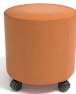
1575/R A : 17" C : 18"