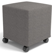
1510/R A : 17" C : 18"