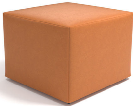
1520/R A : 24" C : 18"