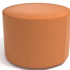
1585/R A : 24" C : 18"