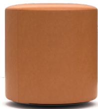
1575 BD A : 17" C : 18 1/2 "