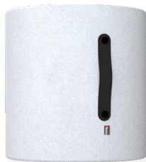
Handle option (PP)